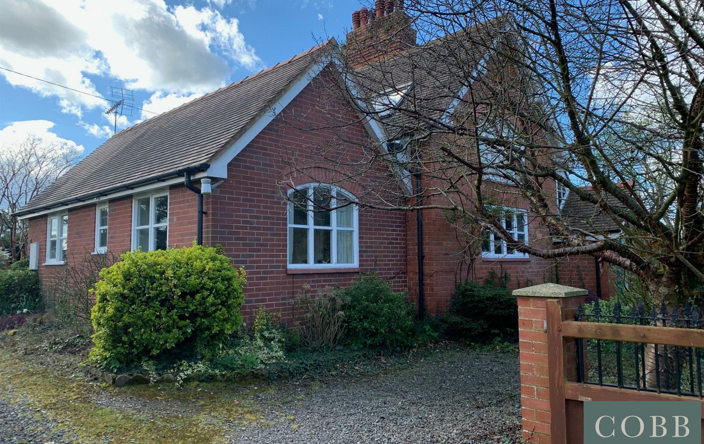
Springfield Cottage, Greete, SY8 3BZ Price £375,000